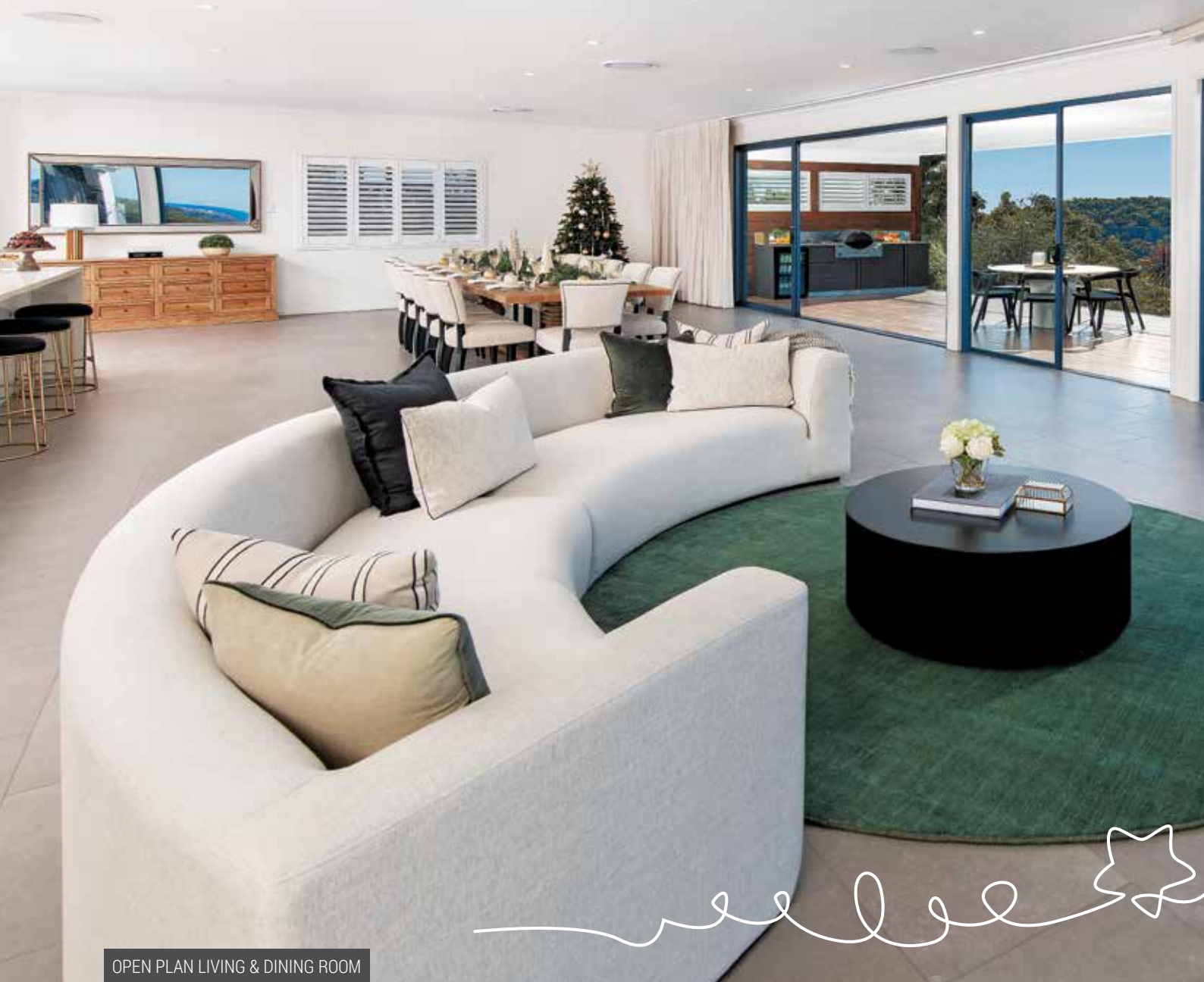
OPEN PLAN LIVING & DINING ROOM