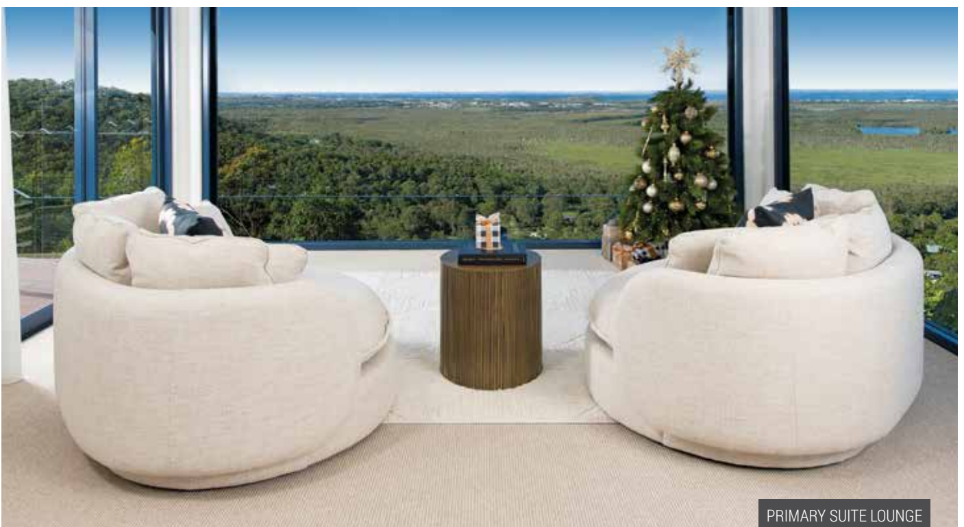
PRIMARY SUITE LOUNGE

*Rental estimates are derived from third-party appraisals and are subject to fluctuating market conditions. **Estimated Airbnb rental income sourced from Airbnb as at August 2024.