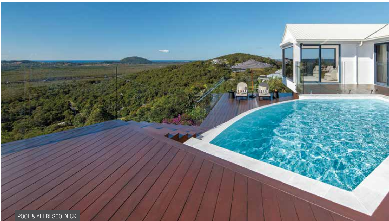
POOL & ALFRESCO DECK